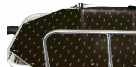
X-ray permeable Sheet

IT IS ANOTHER ESSENTIAL PART OF ANY EMERGENCY INSTRUMENT, THIS OXYGEN CYLINDER CAGE HELPS TO CARRY A CYLINDER WITH A TROLLEY TO PROVIDE LIFE SUPPORT TO THE PATIENT.