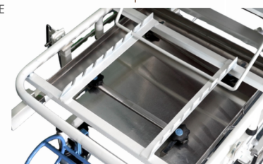
X-Ray Cassette Tray Under Stretcher Top

Designs and specifications are subject to change without notice. All images of the product, its components and accessories may not reflect the final product. The images may reflect optional equipment and are subject to change without notice. All information presented herein is based on current data or design goals available at the time of posting and is subject to change without notice. Some equipment and/or features may be unavailable. Actual results of performance and other specifications may differ or vary with production models and may depend on selected models and/or accessories.