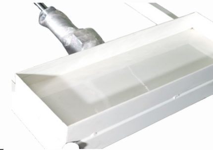
Storage space For Medicine.