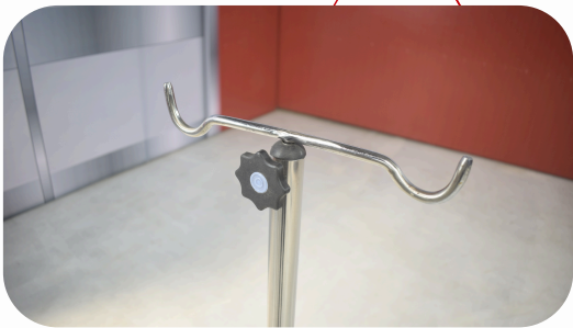
IV Rod Provision